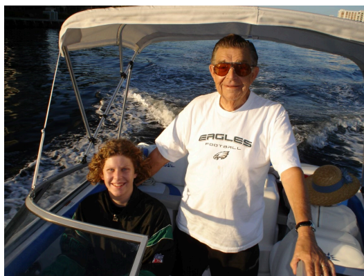
This is a photo of Dad, a die-hard Eagles fan, at the helm, teaching my son how to navigate!